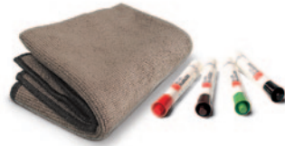
Included Cleaning Cloth and Markers

Whiteboard 4 Egan markers 1 Cleaning cloth 1 Pen tray Assembly instructions and warranty