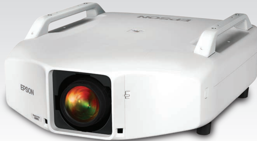
Projector shown with lens. Lens sold separately.