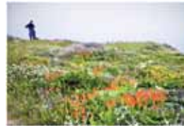
High color light output