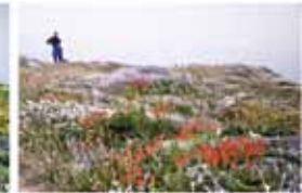
Low color light output

Actual photographs of images taken from two competing projectors run in default mode. Price, resolution and brightness (white light output) are the same for both projectors.