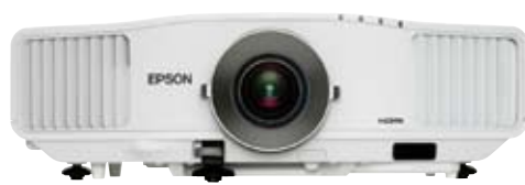
G5150NL and G5350NL Front