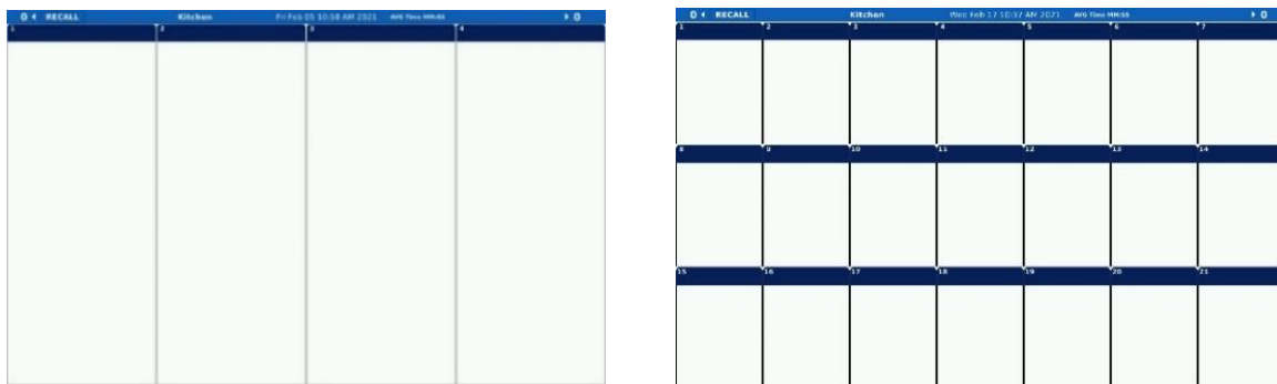
Figure 0.1 – 1x4, 2x5 and 3x7 Tile Arrangement