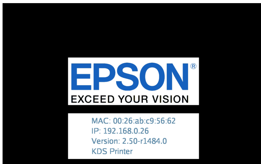
Figure 0.1 – Startup screen of the KDS

By default, KDS devices ship DHCP enabled, allowing them to be easily added and discovered on the local network. It may be necessary to configure the devices to a static IP and this guide explains how to do that from the Windows Configuration Utility. While the IP can be referenced from the Utility, it is also conveniently displayed on the KDS device startup splash screen: